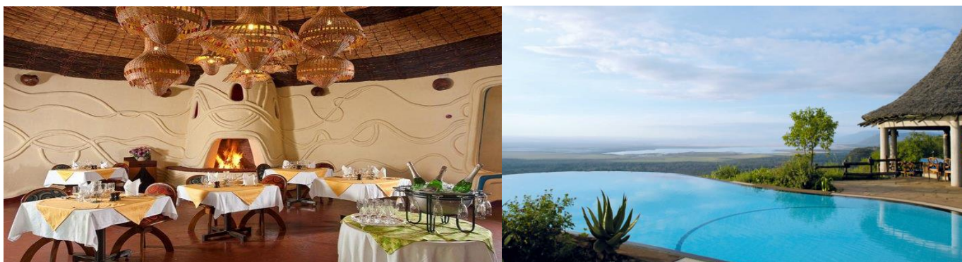
Dinner and overnight – Lake Manyara Serena Safari Lodge